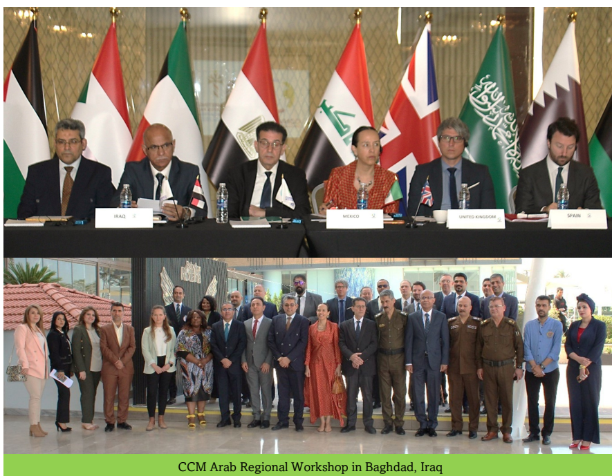
CCM Arab Regional Workshop in Baghdad, Iraq

The “Peace Building and Development through the Convention on Cluster Munitions” Arab Regional Workshop was held in Baghdad, Iraq, on 19 March 2023. The workshop was hosted by Iraq with the financial support of the Governments of the United Kingdom and Norway (through Norwegian People’s Aid), and with the organizational support of the ISU.