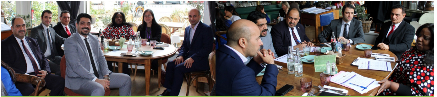
Iraq and the ISU team

On 7 March 2023, the Implementation Support Unit hosted a working lunch for members of the Iraqi Government to discuss preparations for the “ Peace Building and Development Through the Convention on Cluster Munitions ” Arab Regional Workshop to be held in Baghdad, Iraq, on 19 March 2023.