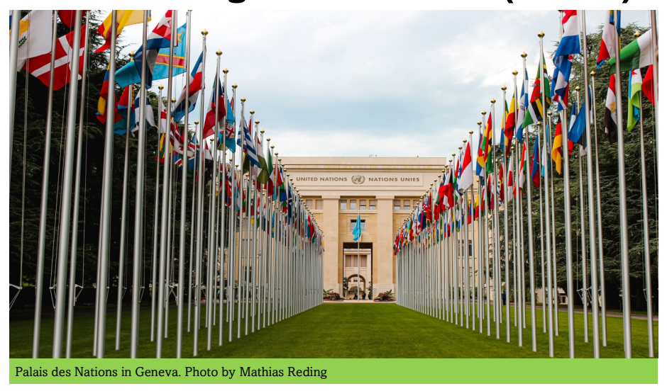
SAVE THE DATE: 30 AUGUST - 2 SEPTEMBER 2022

The Tenth Meeting of States Parties to the Convention on Cluster Munitions (10MSP) is scheduled to take place from 30<sup>th</sup> August to 2<sup>nd</sup> September 2022 at the Palais des Nations in Geneva, Switzerland. The provisional Agenda of the Meeting and the 2023 work plan and budget of the Implementation Support Unit (ISU) of the Convention are now available online here.