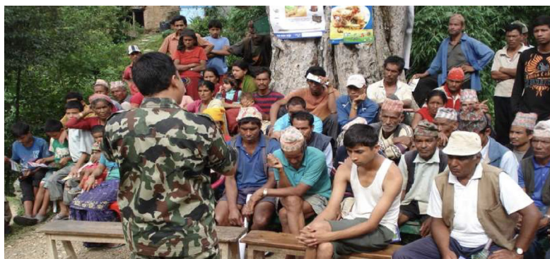
A member of a Nepalese security agency delivering EORE.

The long-term implications of the incorporation of EORE in government and societal structures should be carefully considered. Any initiative should remain flexible enough to be adapted if the circumstances and the need for EORE change.